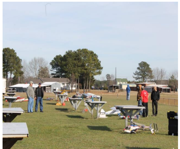
New Year's Day at Waybright Field