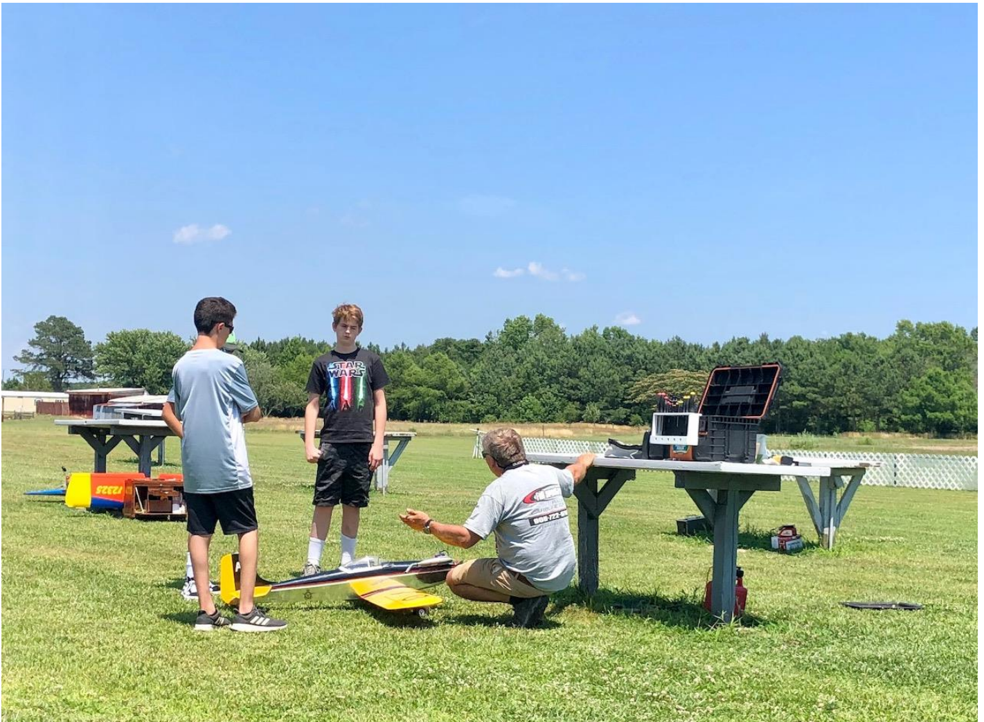
A Saturday session of Teach A Kid To Fly